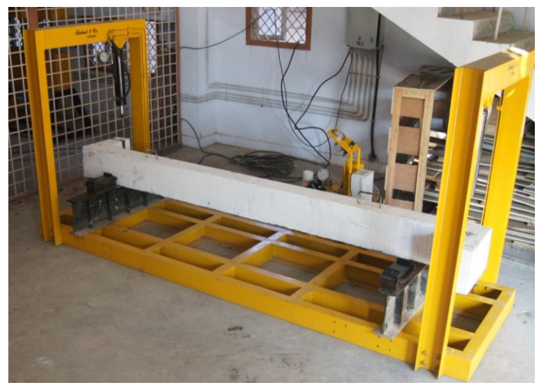
Fig.3.10 Torsion Testing Equipment